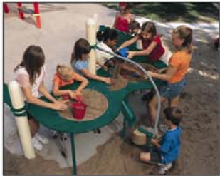
Elevated Sand Table